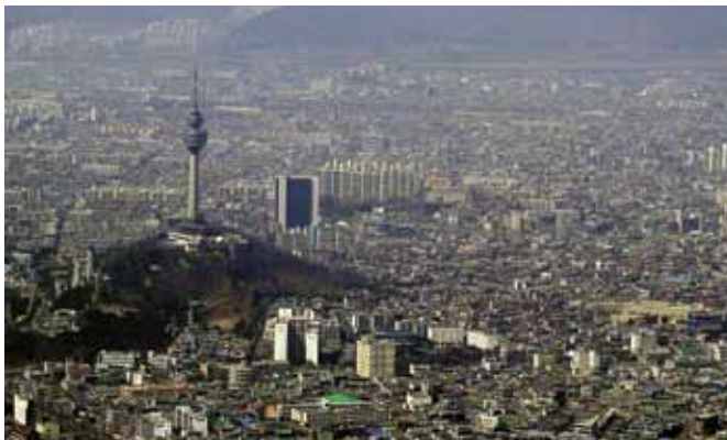
▼ Daegu is South Korea's third largest metropolitan area with a population of roughly 2.5 million.

Daegu is recognized as a hub for industries ranging from textile production to technology to fashion. Major companies