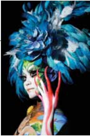
◀ Daegu International Bodypainting Festival is the art form's largest annual celebration.

As if 47 elite athletics events in nine days aren't enough to keep anyone busy, rest assured there's a bit more to do in Daegu.