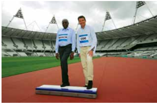
▲ LOCOG chairman Sebastian Coe shows around IAAF president Lamine Diack during an Aug. 5 visit to London Olympic Stadium. The track should be completed any day now.