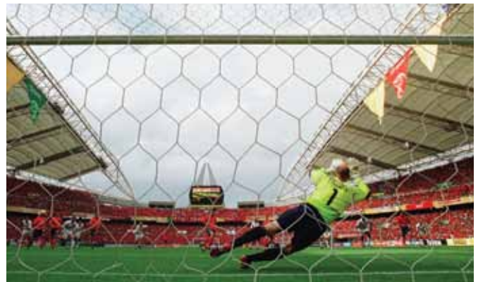
▼ Daegu also hosted the 2003 Summer Universiade as well as a share of the 2002 FIFA World Cup, both at the stadium for these IAAF Championships.

And for those seeking a bit of color – and skin – to get their trip started right, the annual Daegu International Bodypainting Festival at Kolon Field Concert Hall coincides with the opening weekend of these IAAF Championships. ■