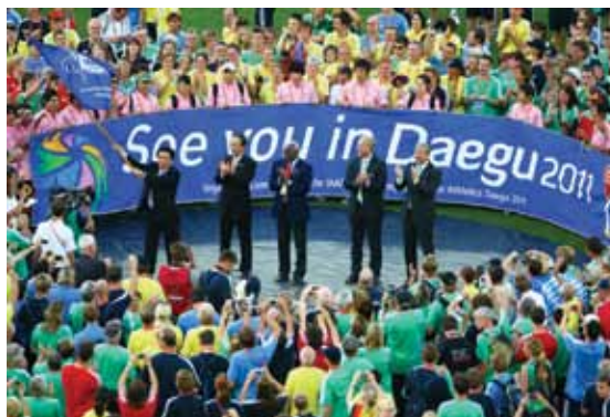
▲ Organizers of the 2009 IAAF World Championships in Berlin set the bar high for Daegu 2011, then handed the flag over to its South Korean leaders.