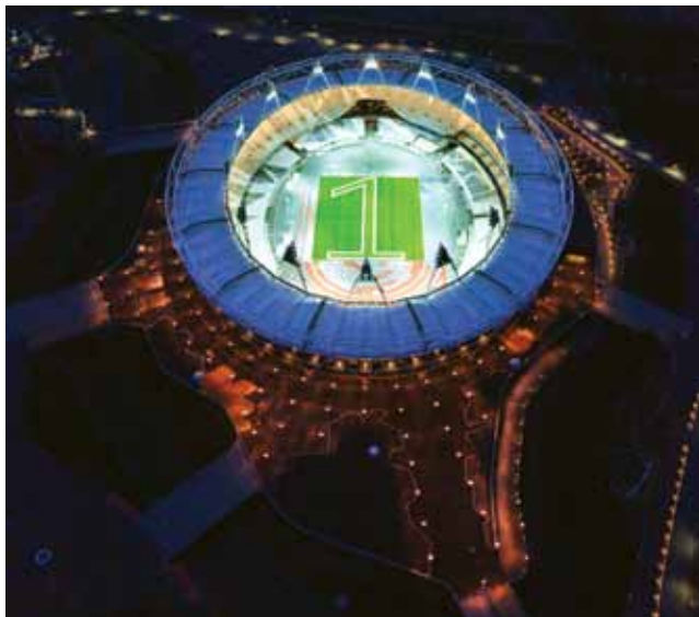
▲ London Olympic Stadium won't have its test event until the British University & Colleges Sport Championships in May 2012.

"I'm glad that we have a few more months yet," he says, "but it will pass very quickly." ■